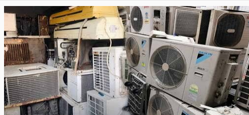
Lot 1 image

Category: Air Conditioning &amp; Temperature Controlling Equipment &amp; Supplies / Chillers | Location: delhi