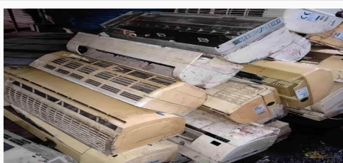
Lot 1 image