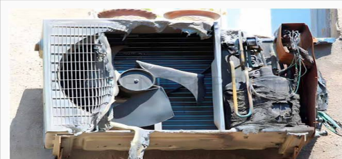
Lot 1 image