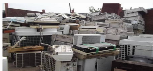
Lot 1 image